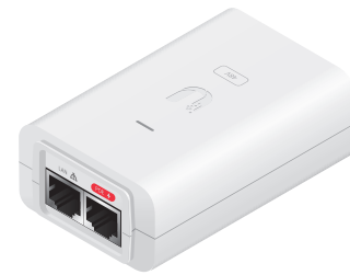
POE-24-24W-G-WH POE-48-24W-WH POE-48-24W-G-WH