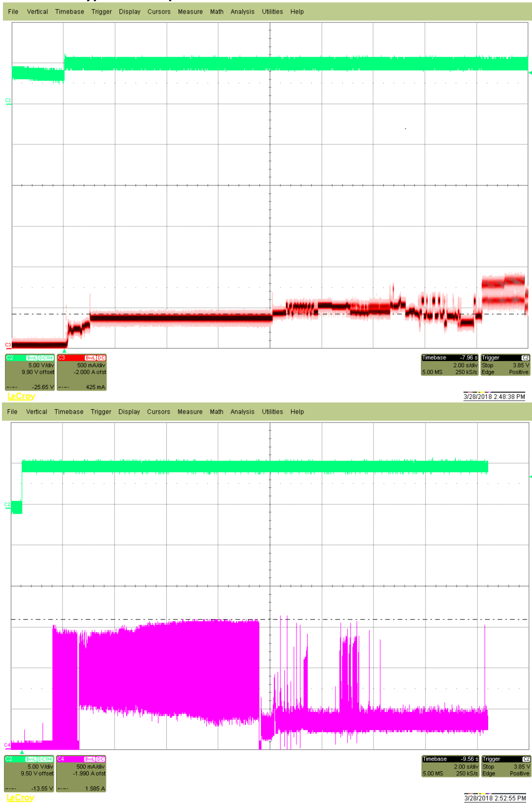
Figure 1. Typical 5V and 12V startup and operation current profiles